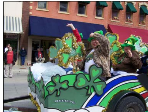
"BEST PARADE ENTRY" TRI-VALLEY DEVELOPMENT CENTER