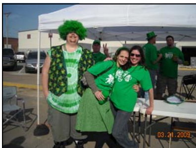
"Friends having fun"