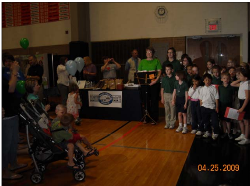
St Patrick's School Choir Performing at the Chanute Expo