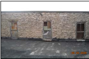
New Chicago upstairs windows “after”